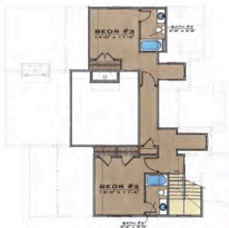
Upper level Floor Plan