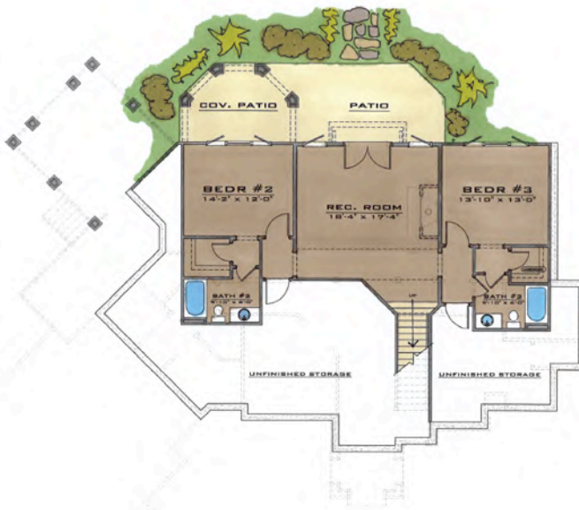
Lower Level Floor Plan 1048 Square Feet