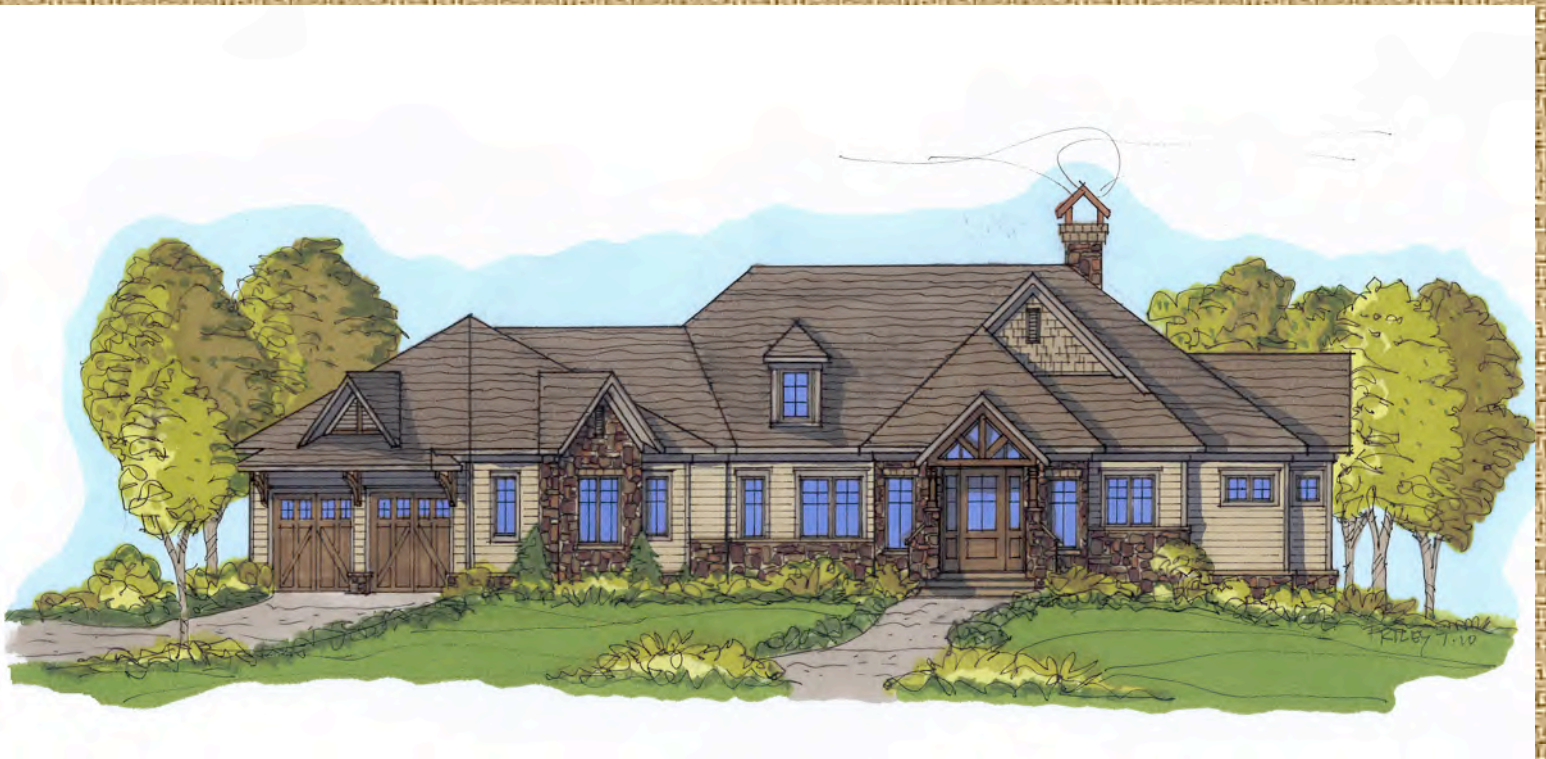
Chauga Gorge Alternate Elevation