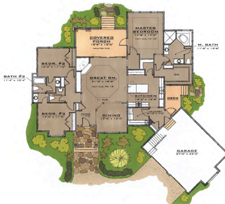
Main Level Floor Plan 2335 Square Feet