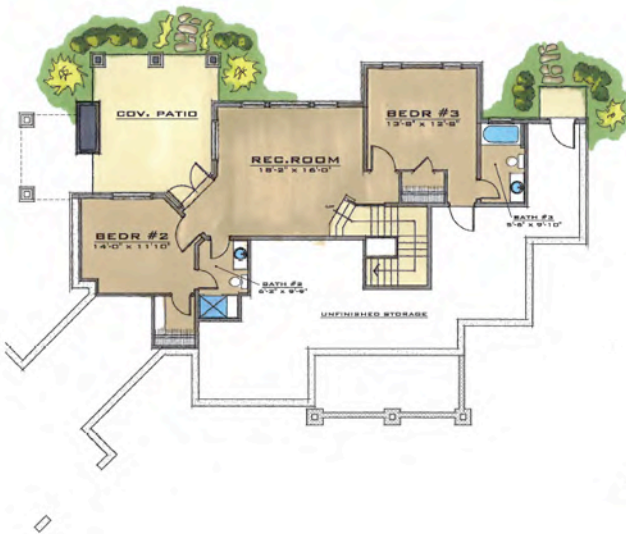
Lower Level Floor Plan 916 Square Feet