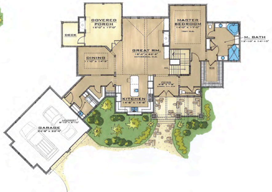
Main Level Floor Plan 1926 Square Feet