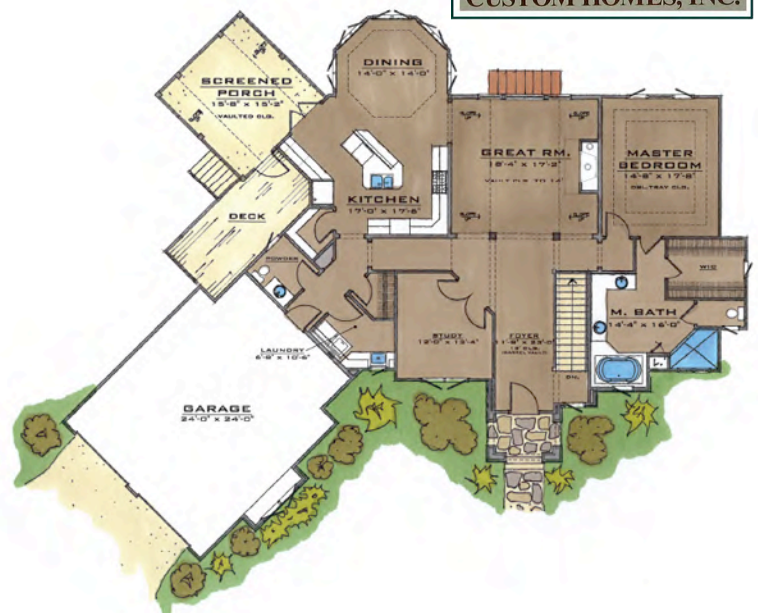
Main Level Floor Plan 2150 Square Feet