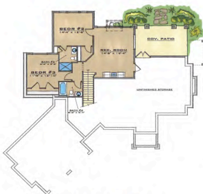
Lower Level Floor Plan 707 Square Feet