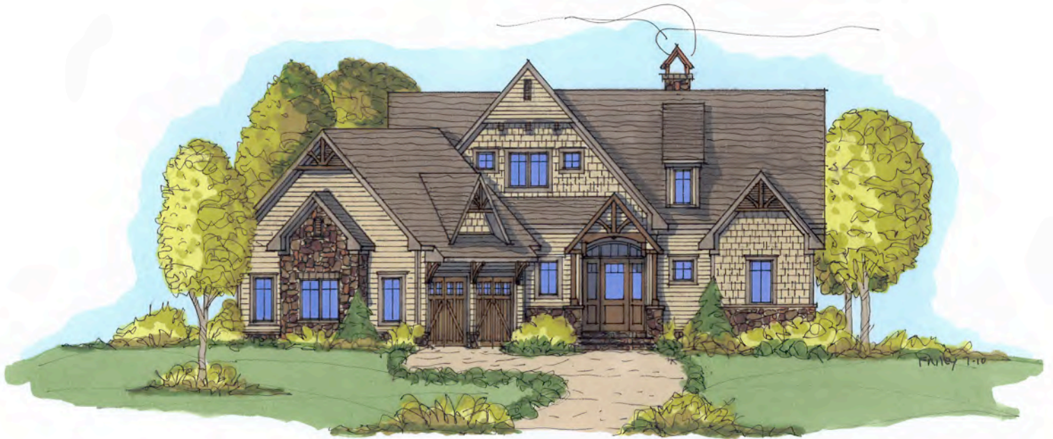
Chestnut Bald Alternate Elevation