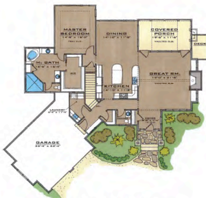
Main Level Floor Plan 1956 Square Feet